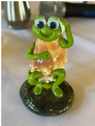
The mascot for National Mexican Ceramics Day.